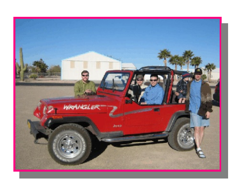
Ready for desert adventure 3-3-08