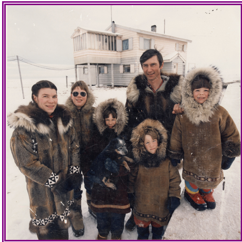
Colville Homesite 1984