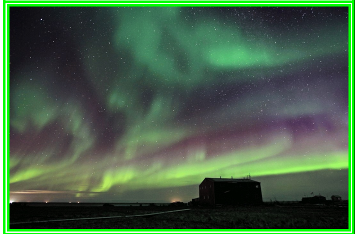
Aurora Sky Over House On The Colville