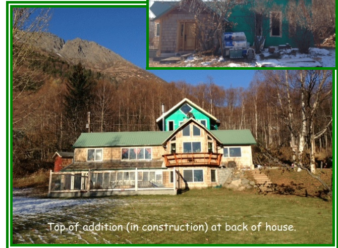
View from driveway side of house →