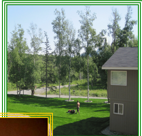
Aaron mowing new lawn

Aaron and Autumn had just moved to a bigger, more remotely located house in NE Wasilla last year. This year was dedicated to some floor upgrades and landscaping, among other projects. New grass and nice stonework around the house and