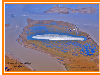
Anachlik Island and Helmericks Homestead. June 2016, lake still with ice.

Jim and Teena are both on Facebook with many picture albums there.